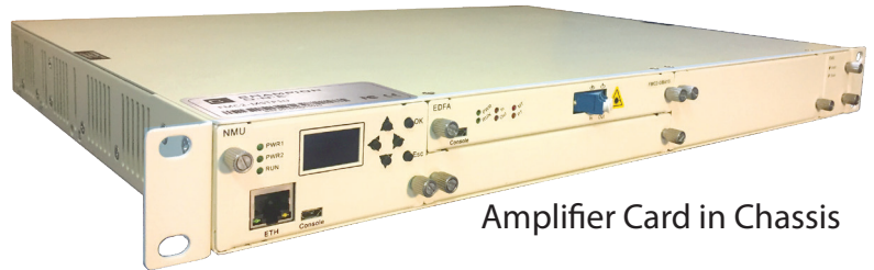
Amplifier Card in Chassis